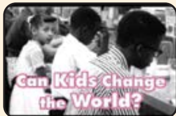
Still from "Can Kids Change the World?"

4 Choose a rule to think about. Who made that rule? Do those people also have to follow it? Who can change it?