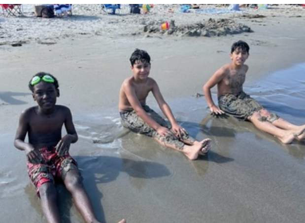
2023 UUFOR BEACH DAY