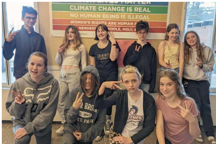
2021-22 OWL Class