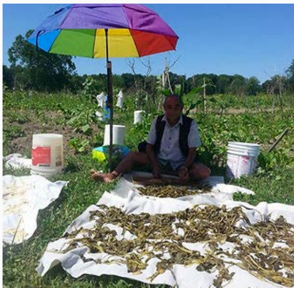
Left: A gardener at Sycamore Community Gardens, which offers plots for organic gardening to low income and refugee families. For more info, go to www.sycamorecommunitygarden.org/who-we-are