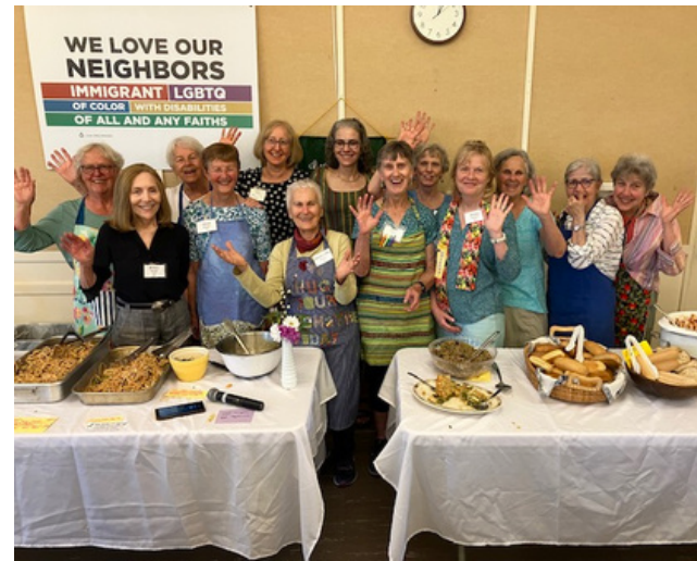
Community Luncheon Never too many SSG cooks in the kitchen!