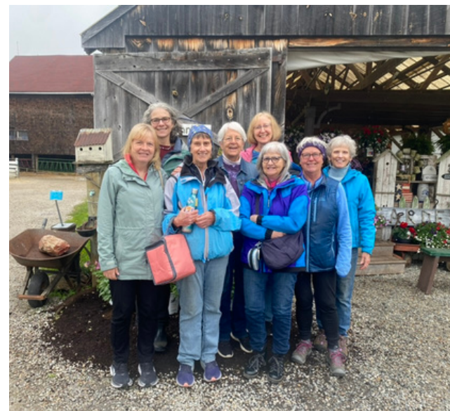
Outing at Beech Hill Farm 75 ice cream flavors!!