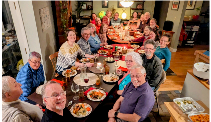
BOARD-HOSTED AUCTION DINNER NOVEMBER 2024

uuconcordnh.breezechms.com/form/auction2025