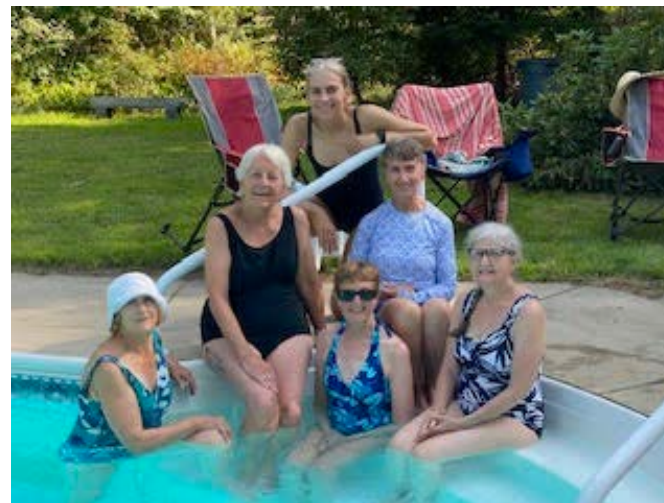
Top photo: Swimming, kayaking, hanging out on the beach at Wadleigh State Park, No. Sutton Bottom photo: A perfect summer day at our VERY COOL POOL Party